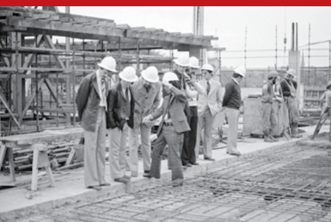
Inspection of reinforcement for Moonee Valley Grandstand (John Connell & Associates, 1977)