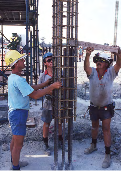
Installation of prefabricated cage in Robina, QLD (1994)