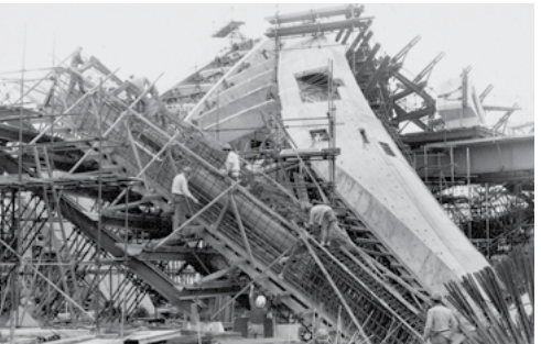
Sydney Opera House construction (Arup, April 1964)