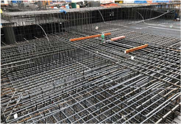
Figure 3 Typical surface condition of reinforcement on site